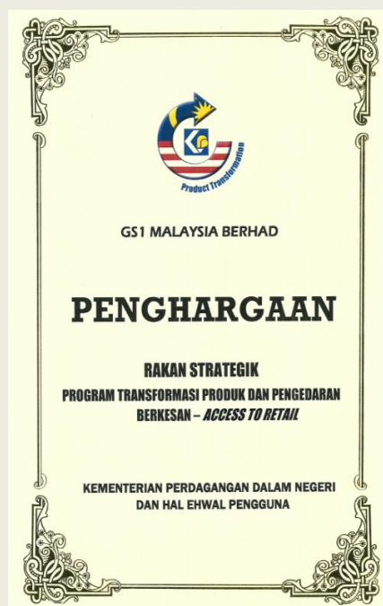
Strategic Partnership Certification from KPDN to GS1 Malaysia