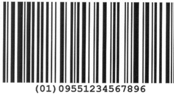
Sample GS1-128 bar code